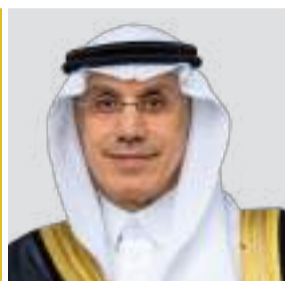
H.E. Dr. Muhammad Al Jasser Chairman, IsDB Group